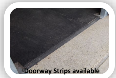
Doorway Strips available