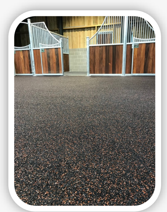
BLACK & RED in STABLE BARN