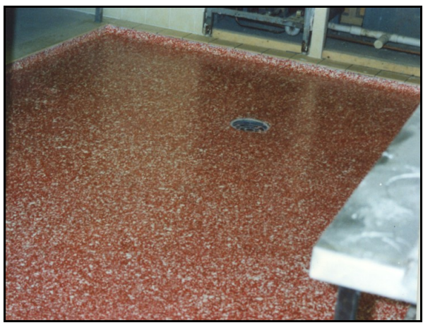
SEMI-FLAKE FLOOR AND WALLS SHOWING MOST OF BASE COLOUR