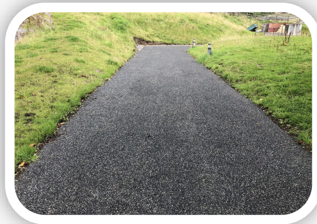
PEARL QUARTZ on WALKWAY